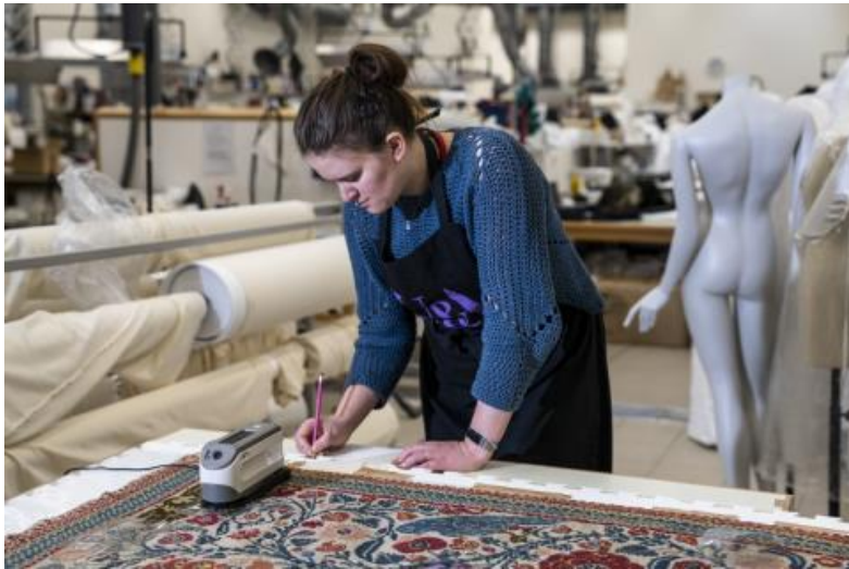
Conservation studios at V&A East Storehouse