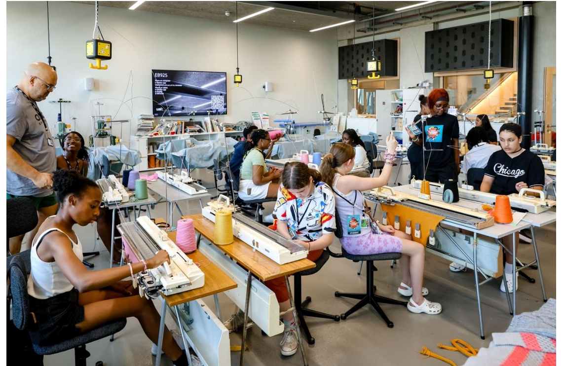
East Summer School 2024