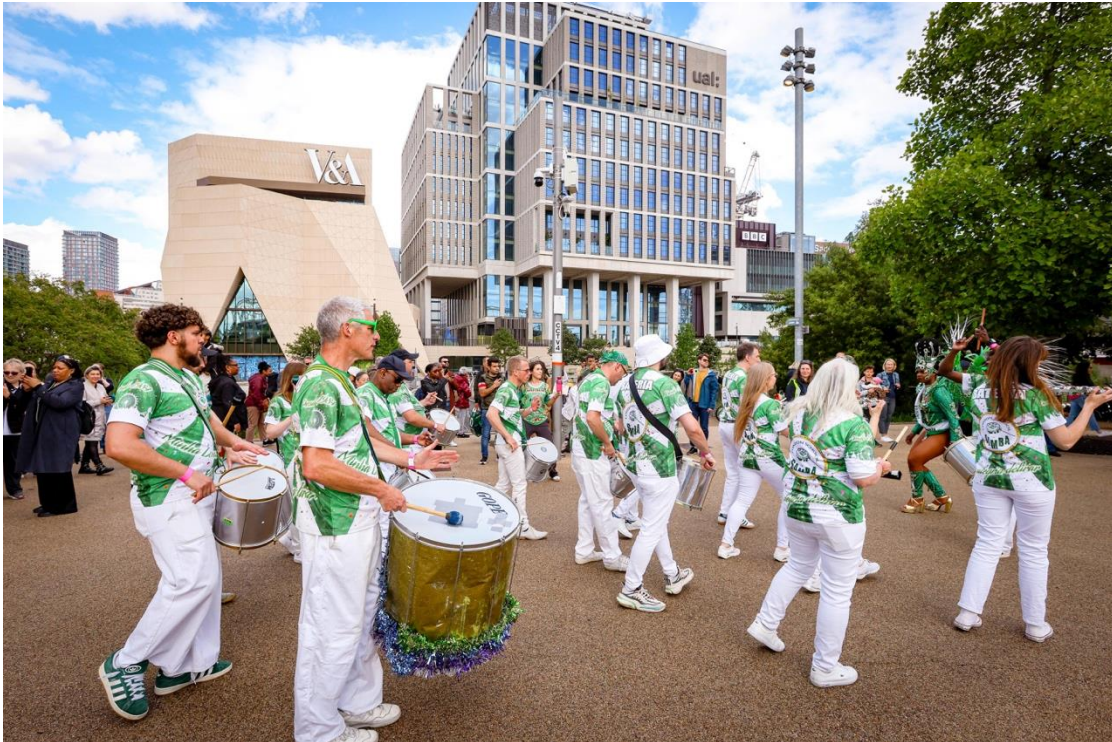
The Great Get Together 2024