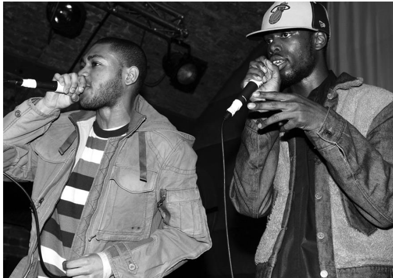
Sam White, 'Kano and Ghetto, i-D Live, Cargo, March 2005'